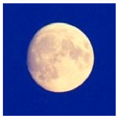
JUNE: Green Corn Moon